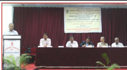
State level workshop on "Digital system design using VHDL on CPLD board" was organised by the department on 10, 11 February 2012.