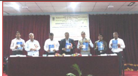
State level workshop on "Digital system design using VHDL on CPLD board" release of course Material.