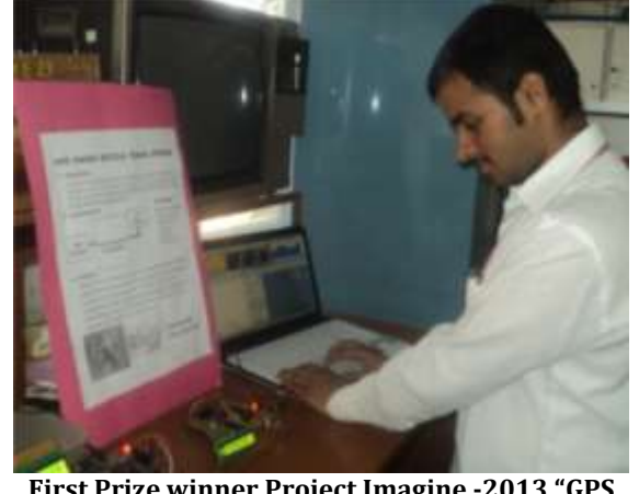
First Prize winner Project Imagine -2013 "GPS Based Bicycle Track System "